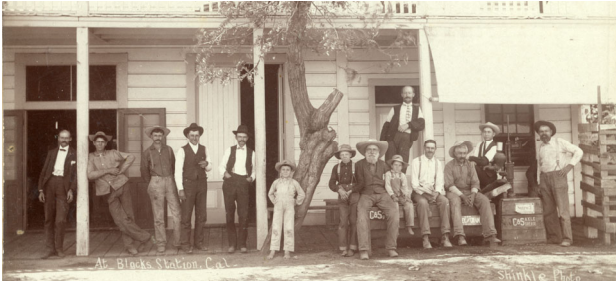
Blacks Station (Zamora). YHM02915. Acc. #2022-005.

Archives staff will perform up to one hour of free research. Additional time is available, upon request, for a fee.