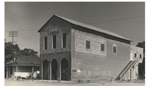
Dunnigan Odd Fellows Hall. 1948. Photo YHM02917. Acc. #2022-005.

View Archives collections through our Axiell database, Online Archive of California, California Revealed, and the Yolo County Library Catalog. The Archives also has access to ancestry.com and over 5,000 digital newspapers through Newspapers.com .