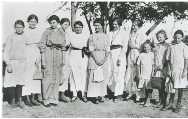
Zamora Sewing Club. Photo G18-003. Acc. #D2011-004.

Schools and School Records: Wildwood School Records (1887-1961), Cacheville School Reunions (1944-2015), Elwyn Richter Collection school books.