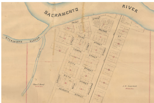
Map of Knights Landing. 1869. J. I. Underhill. Map No. R00014.

River Garden Farms: Corporate records, correspondence, reports, contracts and leases, photographs (1912-1949).