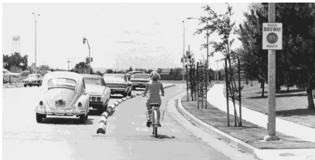
Davis Bikeway on Sycamore Boulevard. 1968. Photo LK04-003. Acc. #2002-020.

Archives staff will perform up to one hour of free research. Additional time is available, upon request, for a fee.