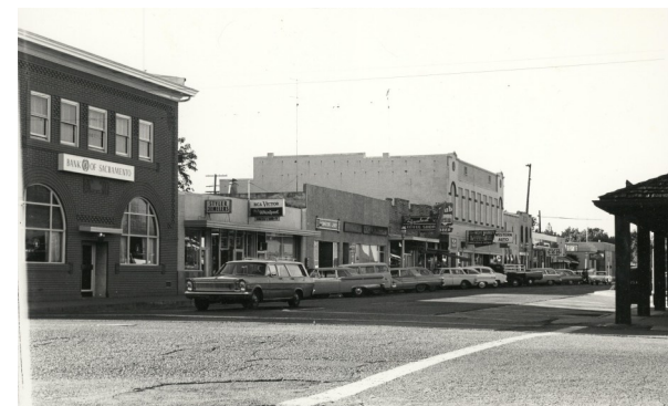
G Street looking north from 2nd Street. 1970. Photo YHM02972. Acc. #2022-005.

View Archives collections through our Axiell database, Online Archive of California, California Revealed, and the Yolo County Library Catalog. The Archives also has access to ancestry.com and over 5,000 digital newspapers through Newspapers.com .