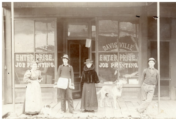
Davisville Enterprise office.

Schools and School Records: Teacher and Principal Reports (1865-1949), UC Davis Yearbooks (1950-1970), Davis High School Yearbooks (1962-2022). Collections have gaps.