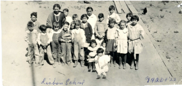
Lisbon School students. 1921-1922. Photo YHM00105. Acc. #2022-005.

Archives staff will perform up to one hour of free research. Additional time is available, upon request, for a fee.