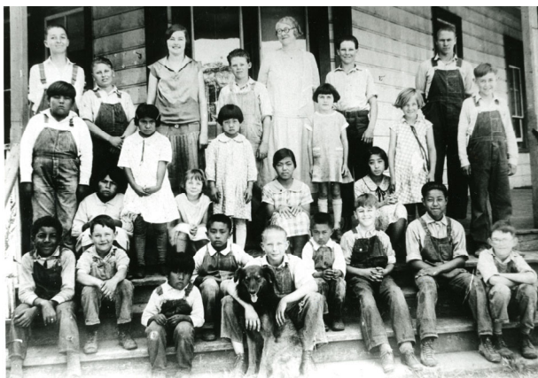
Rumsey School. 1924. YHM02121. Acc. #2022-005.

Clubs and Organizations: Guinda Advancement Club (1908-1925), Capay Valley Farm Center (1946-1954), Esparto Study Club (1934-1989).