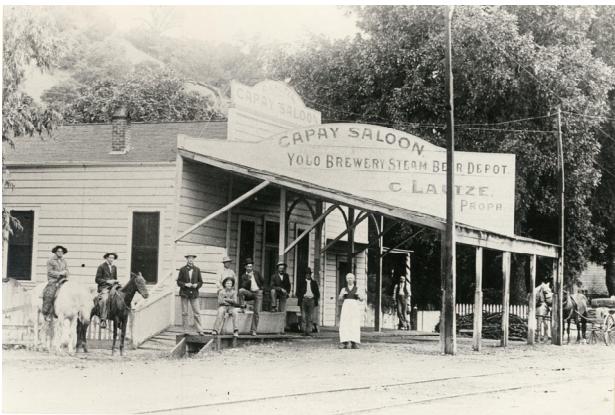
Capay Saloon.

Schools and School Records: Esparto High School Yearbooks (1909-1996), Report of the School Census Marshall (1867-1910).