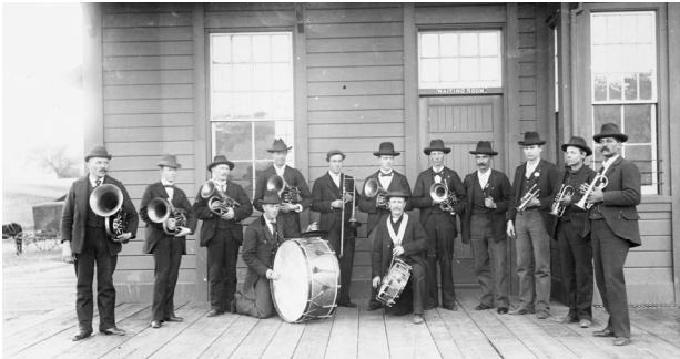
Guinda Band outside the depot. Acc. #2010-019.

The Friends of the Yolo County Archives was founded in 1986 as a non-profit organization whose purpose is to support the services and facilities of the Yolo County Archives.