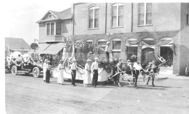
Esparto Almond Festival float. 1916. Photo D19-010. Acc. #1997-026.

View Archives collections through our Axiell database, Online Archive of California, California Revealed, and the Yolo County Library Catalog. The Archives also has access to ancestry.com and over 5,000 digital newspapers through Newspapers.com.