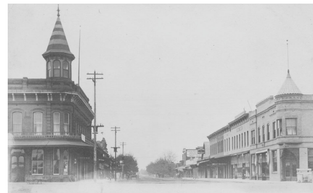
Main Street looking west from Railroad Avenue. Photo I11-005. Acc. #1993-015.

View Archives collections through our Axiell database, Online Archive of California, California Revealed, and the Yolo County Library Catalog. The Archives also has access to ancestry.com and over 5,000 digital newspapers through Newspapers.com .