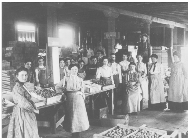
Workers in the Earl Fruit Company Packing Shed. July 1903. Photo I01-003.

Winters Tales Oral Histories: 24 interviews with Winters residents conducted by the Winters Friends of the Library (1999-2002). Transcripts available at the Archives. Audio has been digitized by California Revealed.