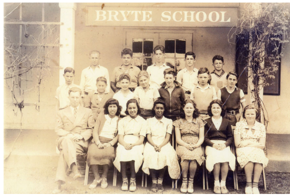
Bryte School. 1938.

School Records: James Marshall High School yearbooks and newsletters (1958-1974), Teacher and Principal Reports (1865-1949), Report of the School Census Marshall (1867-1910).