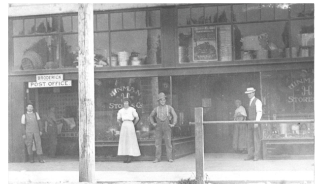
Broderick Post Office. 1911. Photo D06-017. Acc. #1991-011.

View Archives collections through our Axiell database, Online Archive of California, California Revealed, and the Yolo County Library Catalog. The Archives also has access to ancestry.com and over 5,000 digital newspapers through Newspapers.com .