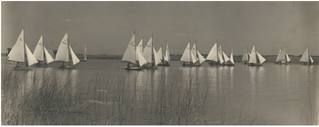
Sailboats on Lake Washington. Photo by Paul Hollingshead. Oversize photo C-018. Acc. #1986-005.

Archives staff will perform up to one hour of free research. Additional time is available, upon request, for a fee.