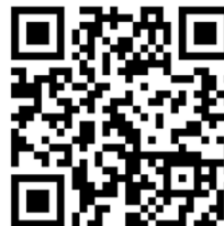
Photo Collection: Images of people, places, and activities from numerous sources. Many photographs have been digitized and can be viewed online through our database.

Veterans of Foreign Wars Elmer E. Van Law Post No. 3237: Correspondence, minutes, membership lists (1936-1968).