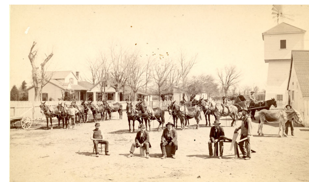
Fair Ranch (later River Garden Farms). Photo YHM01813. Acc. #2022-005.

View Archives collections through our Axiell database, Online Archive of California, California Revealed, and the Yolo County Library Catalog. The Archives also has access to ancestry.com and over 5,000 digital newspapers through Newspapers.com .