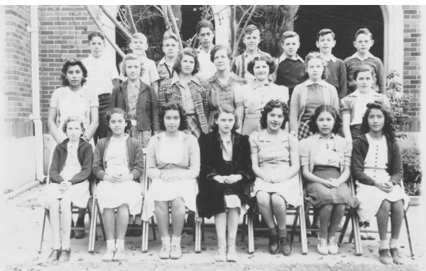
7th and 8th grade students at Grafton School. 1940. Photo H13-021. Acc. #1994-004.

Newspapers: Knights Landing News (1859-1864), available via California Revealed: https://californiarevealed.org/partner/yolo-county-archives?f%5B0%5D=search_block_series_title%3AKnight%27s%20Landing%20News