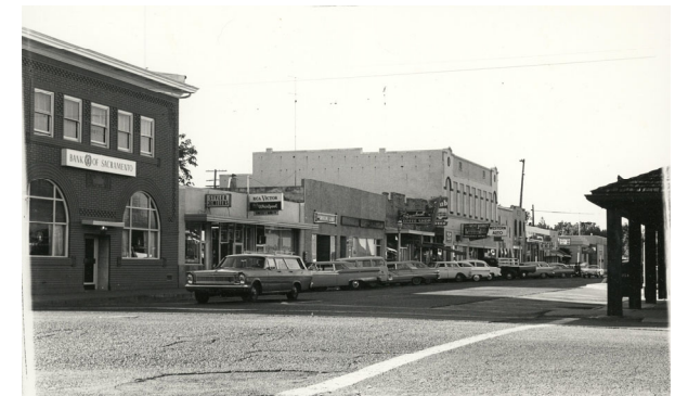
G Street looking north from 2nd Street. 1970. Photo YHM02972. Acc. #2022-005.

View Archives collections through our Axiell database, Online Archive of California, California Revealed, and the Yolo County Library Catalog. The Archives also has access to ancestry.com and over 5,000 digital newspapers through Newspapers.com .