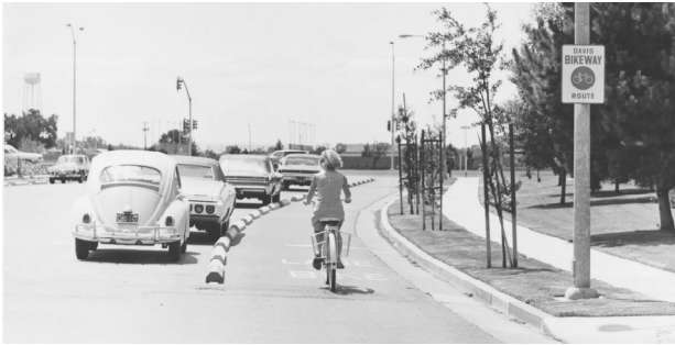
Davis Bikeway on Sycamore Boulevard. 1968. Photo LK04-003. Acc. #2002-020.

The Friends of the Yolo County Archives was founded in 1986 as a non-profit organization whose purpose is to support the services and facilities of the Yolo County Archives.