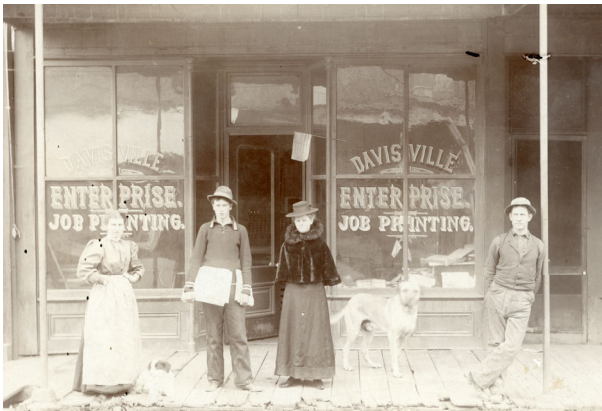
Davisville Enterprise office. Photo YHM02460. Acc. #2022-005.

Schools and School Records: Teacher and Principal Reports (1865-1949), UC Davis Yearbooks (1950-1970), Davis High School Yearbooks (1962-2022). Collections have gaps.