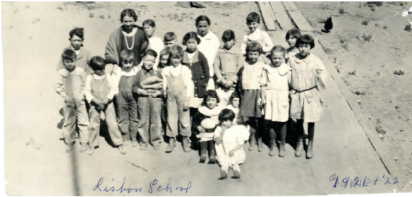
Lisbon School students. 1921-1922. Photo YHM00105. Acc. #2022-005.

Archives staff will perform up to one hour of free research. Additional time is available, upon request, for a fee.