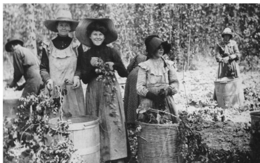
Women picking hops in Elk Horn c. 1900. O01-041.