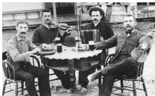
Four musicians in front of Burgess Saloon in Zamora. 19th c. LK10-003.