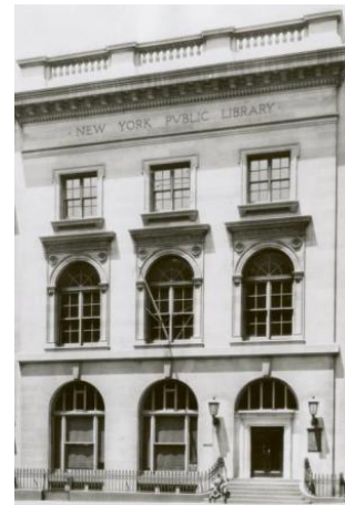
The St. Agnes Branch of the New York Public Library in the early 1970s.