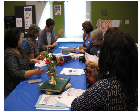
Right: Attendees enjoying delicious food provided by Nugget Market, Raley's, Panaderia Mana, and other attendees.