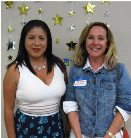
Left: Two attendees posing for a photo.