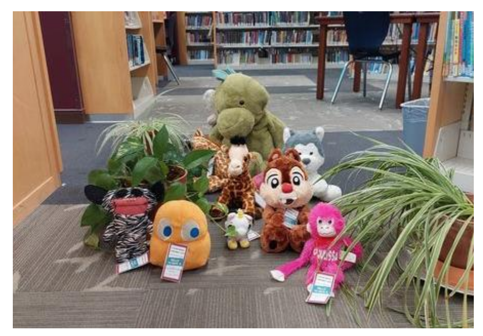
West Sacramento Stuffed Animal Sleepaway Camp at the Arthur F. Turner Community Library.