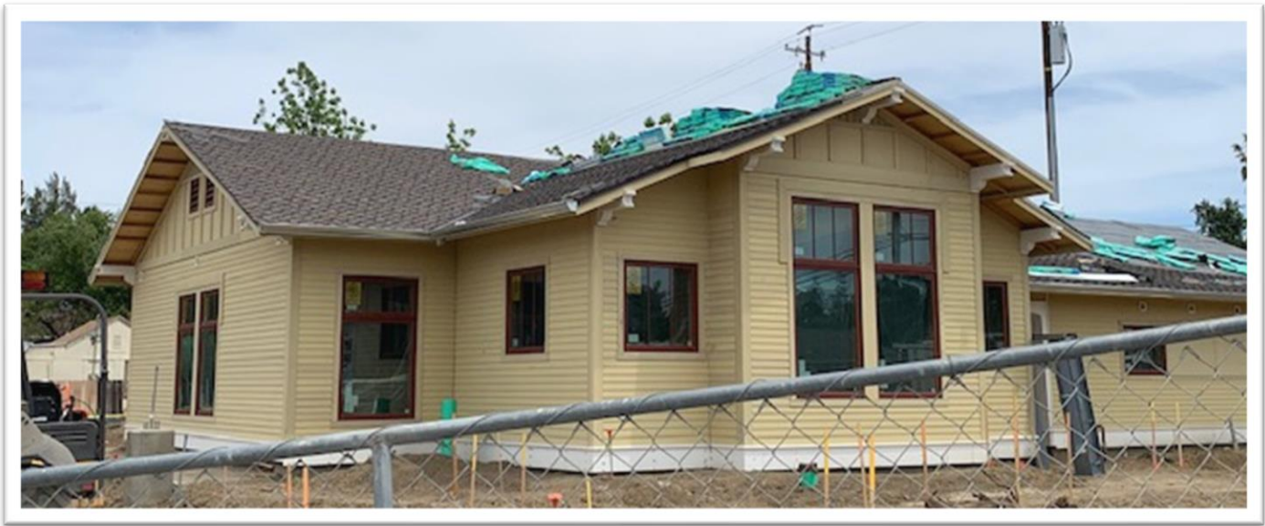
The front entrance of the Library is to the right of the large window