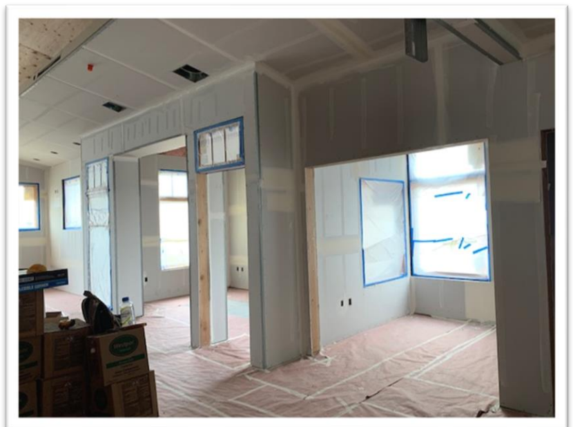
These spaces will be enclosed study rooms