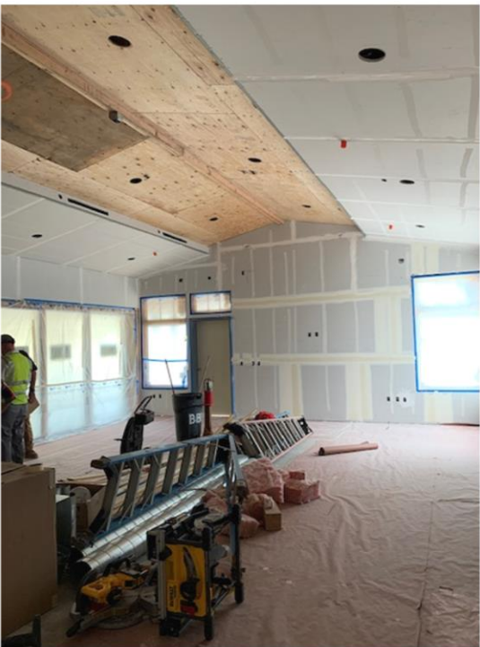
This will become the Children's area of the Library