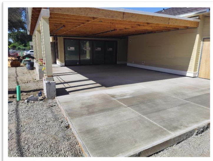
Outdoor patio off the Community Room