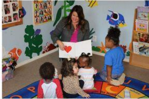
Yolo Crisis Nursery yolocrisisnursery.org

The Yolo Crisis Nursery offers voluntary and free, nurturing childcare for ages birth through five years, 24 hours per day 365 days per year. Equally important are the Yolo Crisis Nursery's wraparound services that help parents resolve the problems that brought them to our door.