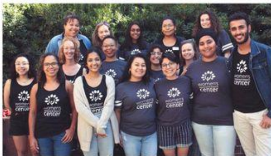
UC Davis Women's Resources & Research Center wrrc.ucdavis.edu

The Women's Resources and Research Center (WRRC) challenges all forms of oppression, through the lens of gender equity. The WRRC provides education, advocacy, resources, and a safe space that centers the experiences of women, transgender, femme, and non-binary individuals.